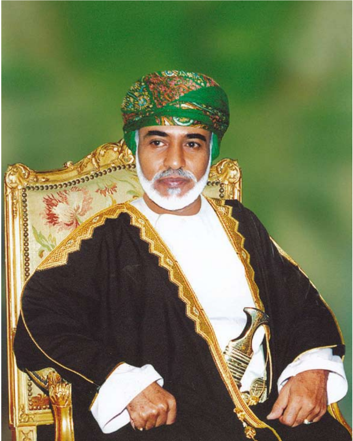
His Majesty Sultan Qaboos Bin Said