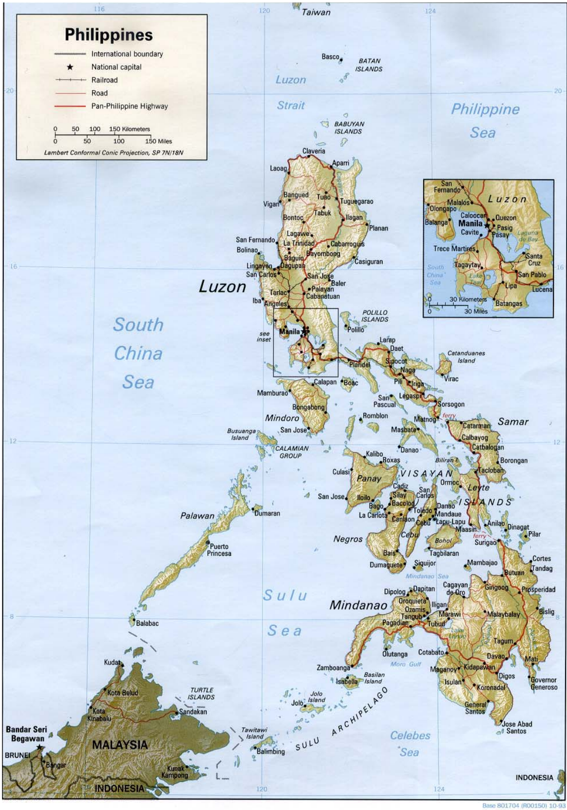
Figure 1. Relief map of the Philippines.